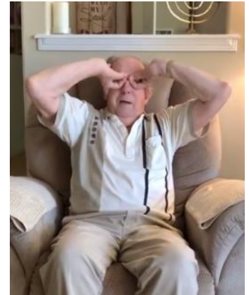
Up In The Air, Junior Birdman!