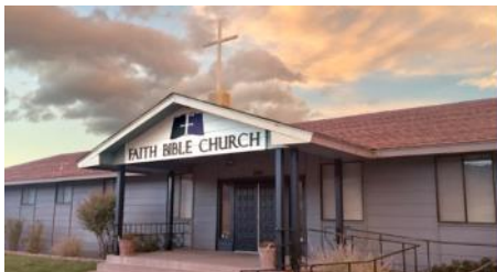
Faith Bible Church, Reno, NV