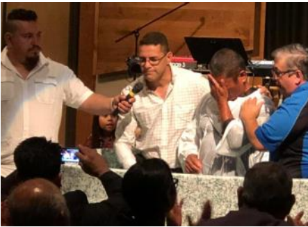
Baptismal service this past Fall